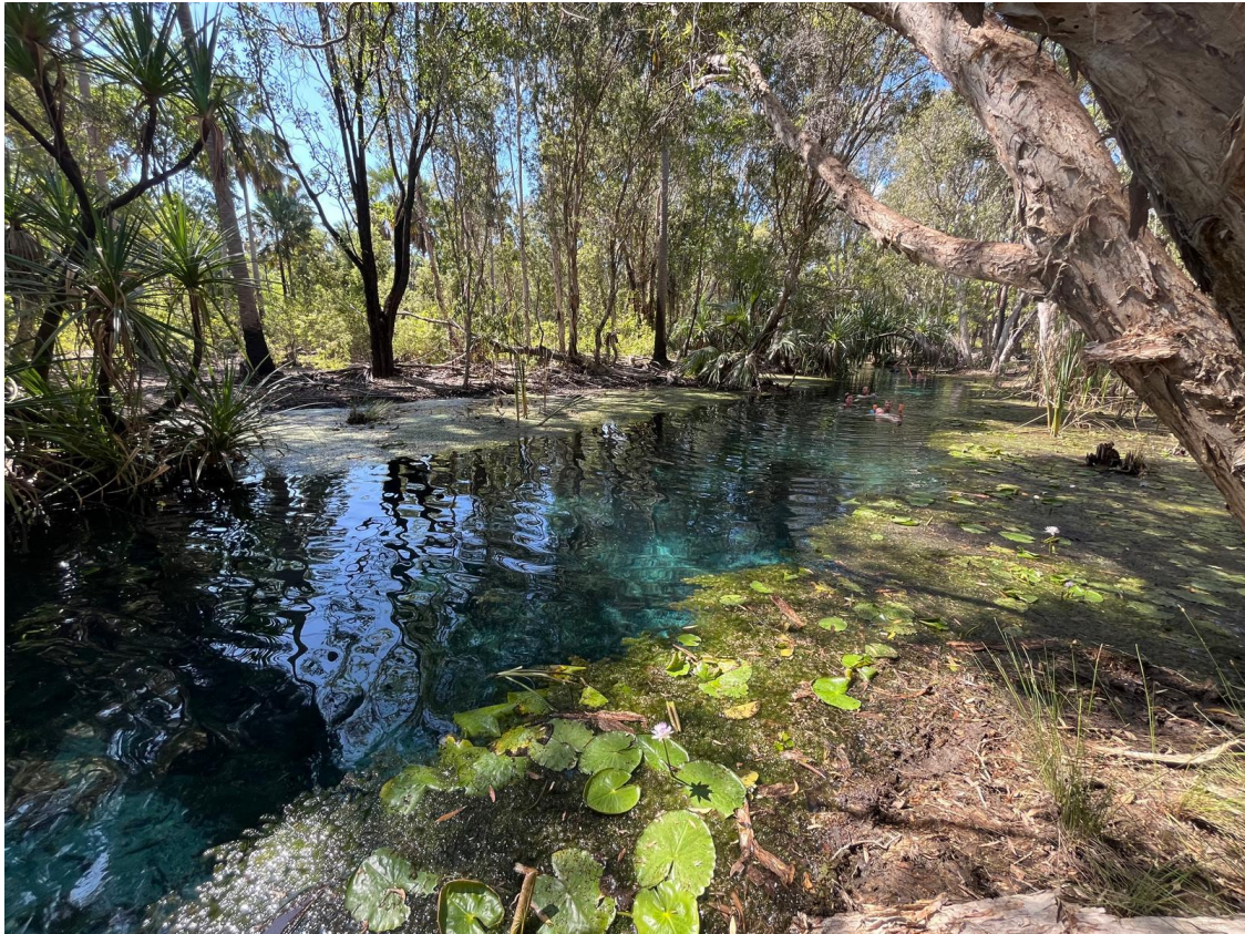
Korran (Bitter Spring).