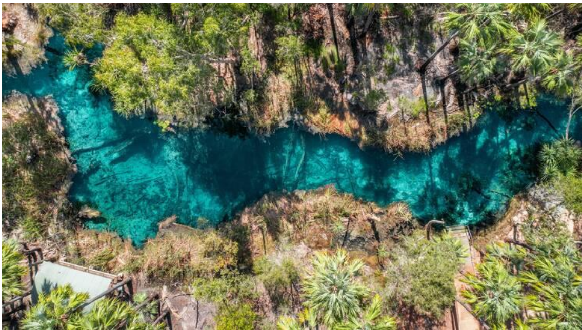
Aerial Image of Korran (Bitter) Spring.