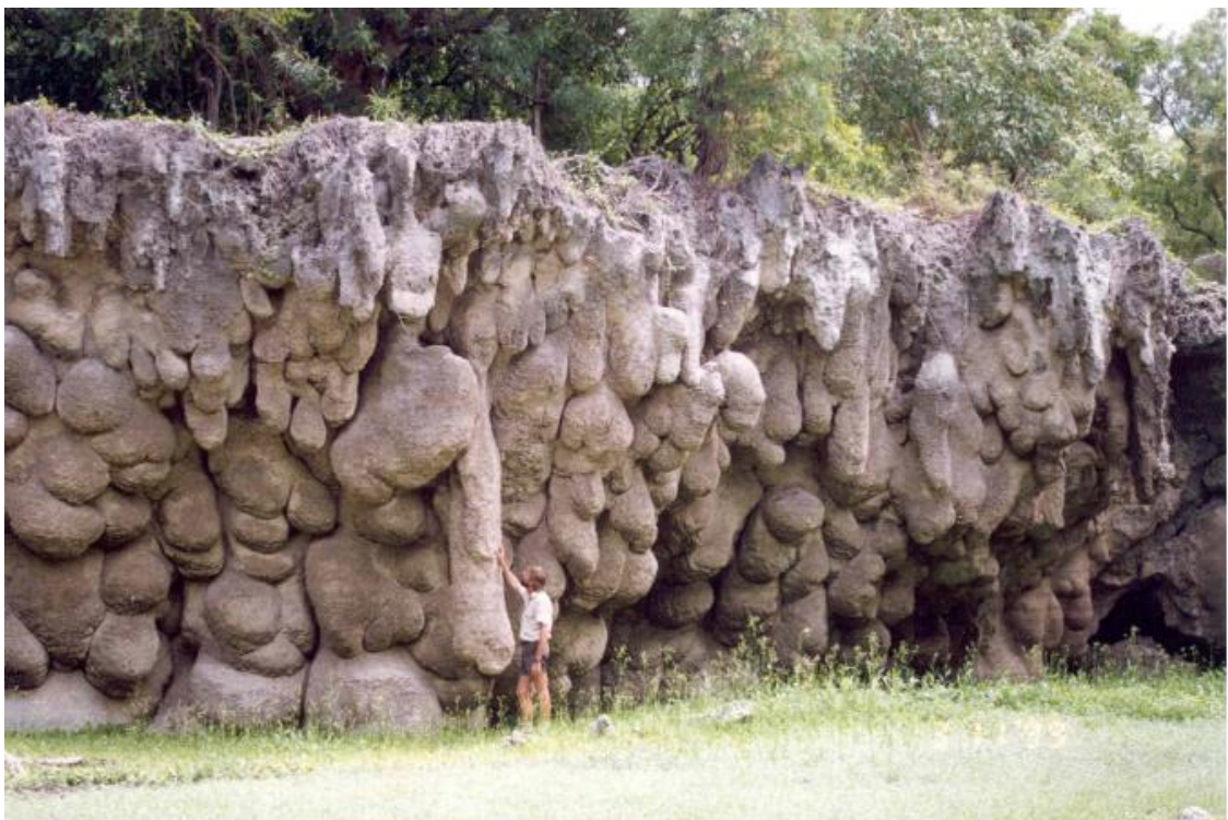
Tufa dam along Eley Creek (East of Bitter Spring); formed at a time when groundwater discharge was greater than today