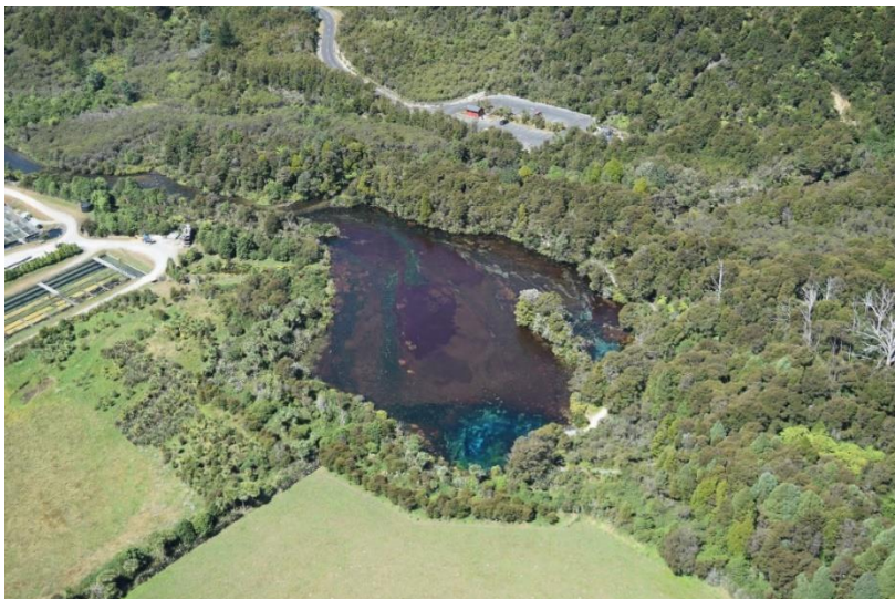
Aerial shot of Te Waikoropupu Springs taken in 2021. The image shows the springs, the carpark for scale and at left the edge of a fish farm that uses some water from the springs outflow. Within the springs pool is the blue Main Spring at left and Dancing Sands Spring at right, their combined output being about 10 \text{ m}^3/\text{s} . The reddish colour is aquatic weed.