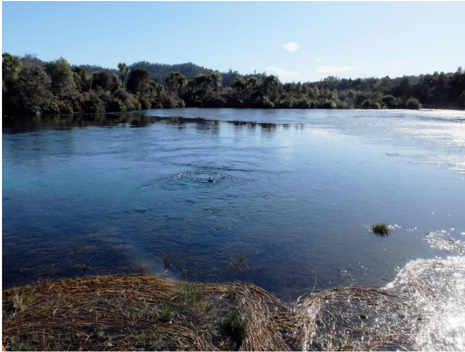
The artesian boil at the Main Spring