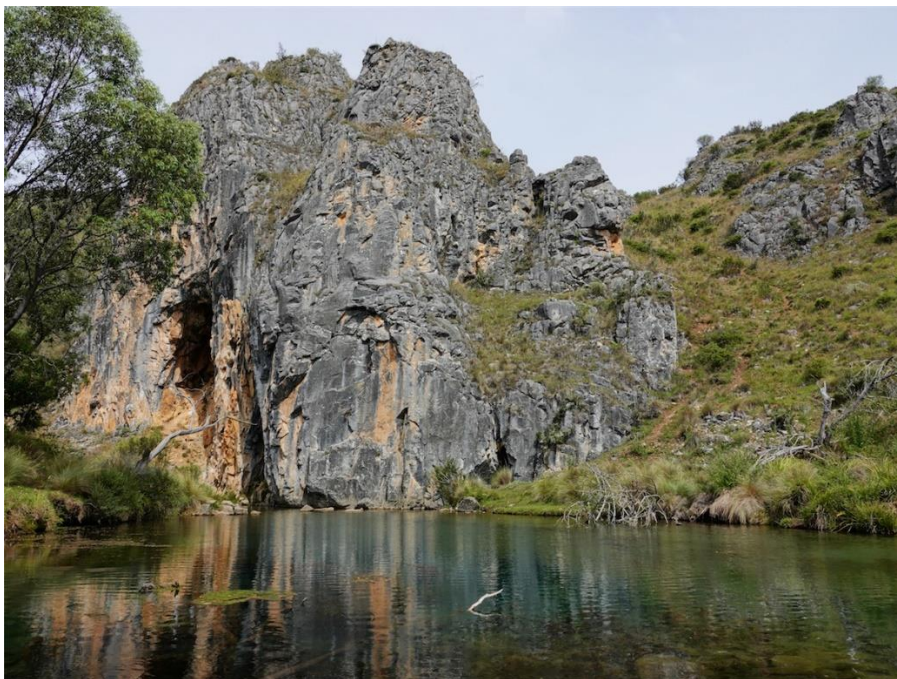
View across the Blue Waterhole. One of the resurgences is in the bottom of the waterhole.