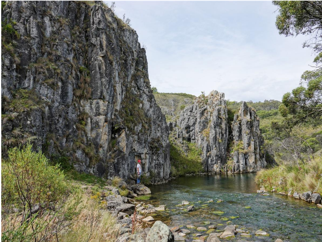
View downstream from the Blue Waterhole.