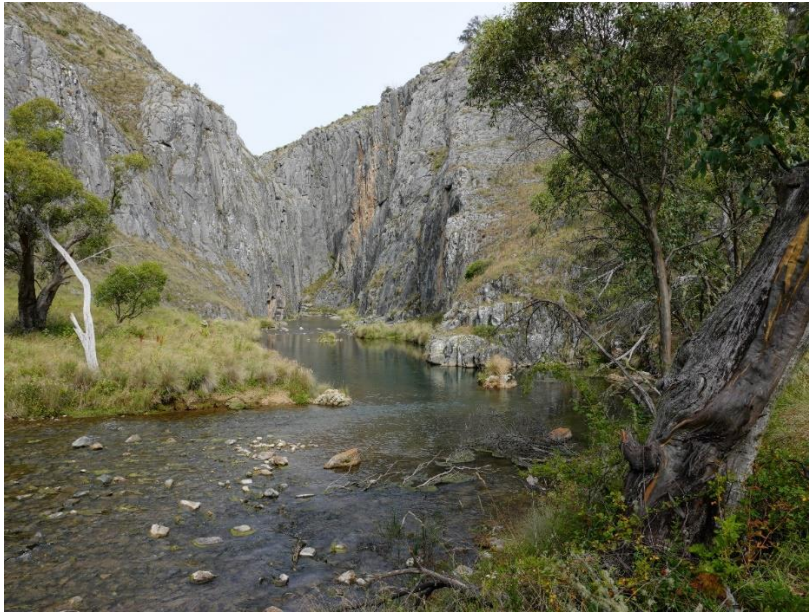
View looking down Coleman Gorge below the Blue Waterhole.