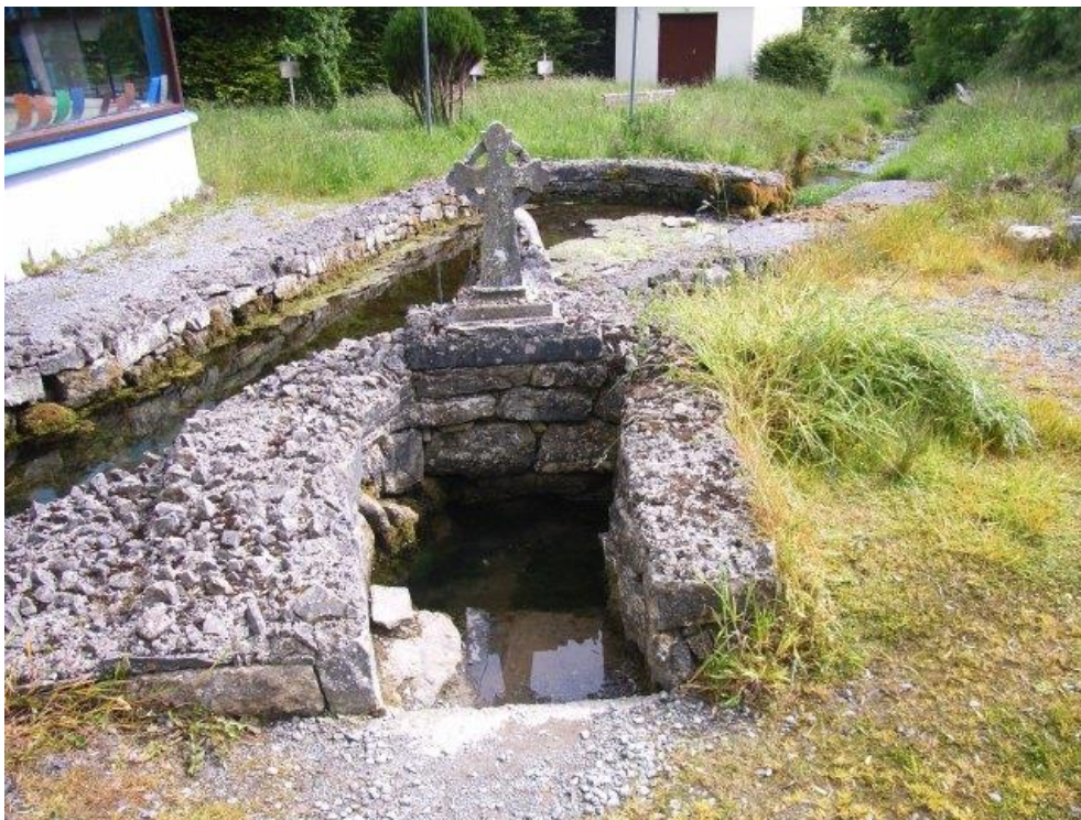
Ogulla holly well (spring)