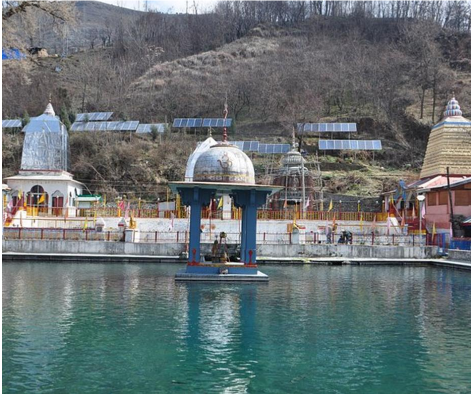
Photo of the Martandnag spring