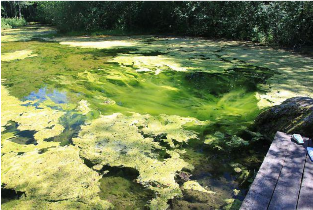
Spring Suurallikas, Vormsi, July 2014