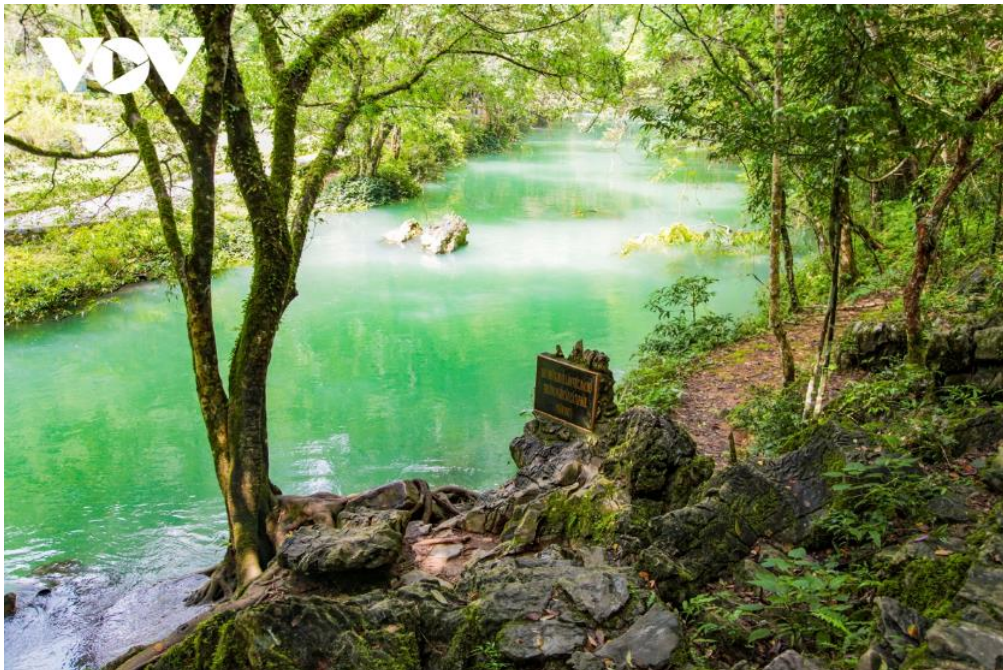
The spring landscape is at PacPo commune, HaQuang district, CaoBang province, Viet Nam