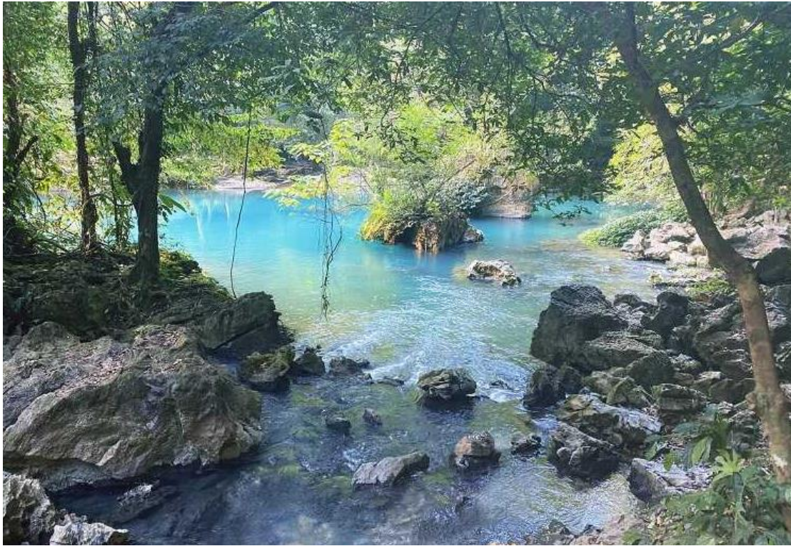
Water flow is from spring at PacPo commune, HaQuang district, CaoBang province, Viet Nam.