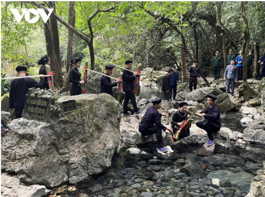
Traditional culture to take water from spring when new year coming.