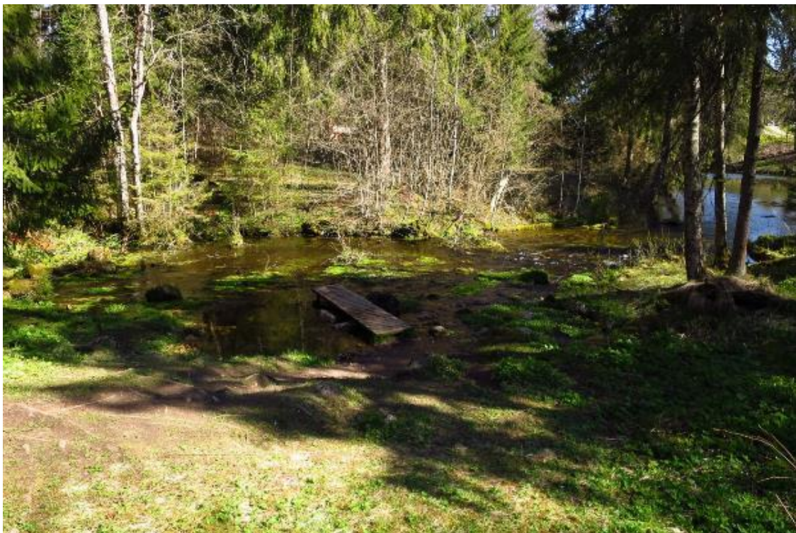
Lavi spring