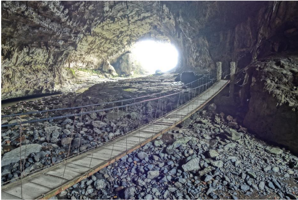
View from the interior of the Ventanas de Tisquizoque cave