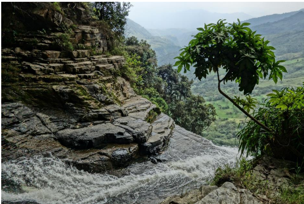
Panoramic view and outflow of La Venta Creek in Ventanas de Tisquizoque