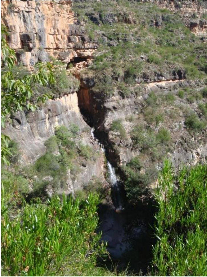
Close up view of the Chiflonqaqa spring waterfall