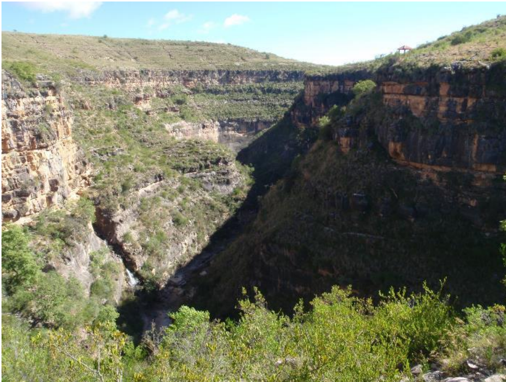
View from the distance of Chiflonqaa spring waterfall on the left side of the Toro Toro canyon